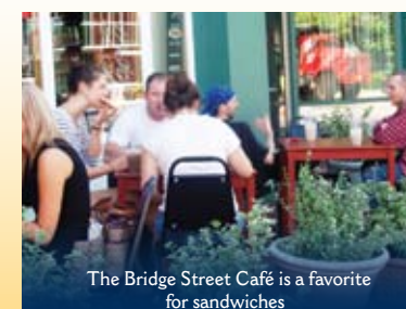
The Bridge Street Café is a favorite for sandwiches