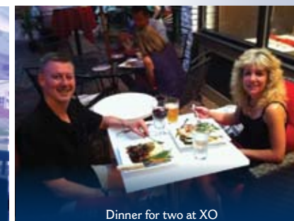
Dinner for two at XO